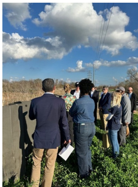
Sankofa Community Development t Corp project at 9th Ward Levees