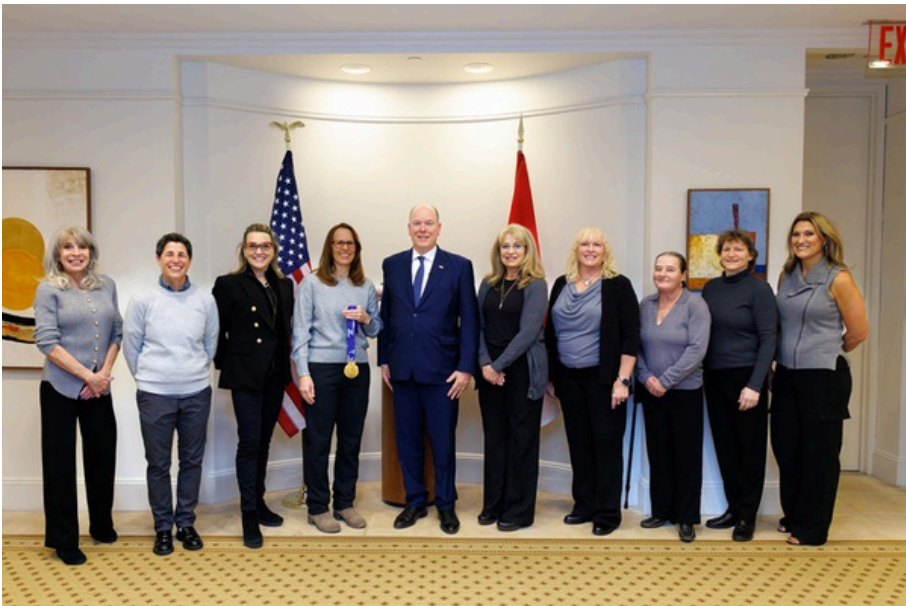
The original Icebreakers team with HSH Prince Albert II

Icebreakers , an upcoming documentary about the pioneering women who formed the first U.S. Women's Bobsled Team , filmed a segment at the Consulate General of Monaco in New York with a special interview with H.S.H. Prince Albert II of Monaco—a five-time Olympian bobsledder and lifelong advocate for athletes and women in sports. Prince Albert met with members of the original Icebreakers team decades after their time on the track. The Icebreakers fondly remember the Prince and his team as kind, generous, and supportive sportsmen.