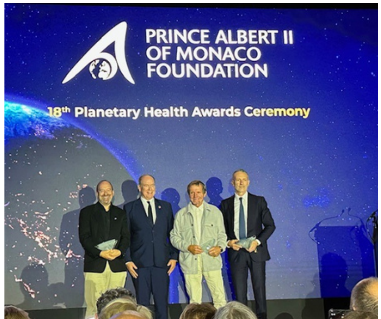
HSH Prince Albert II and the 2025 laureates of the FPA2 Planetary Health Awards