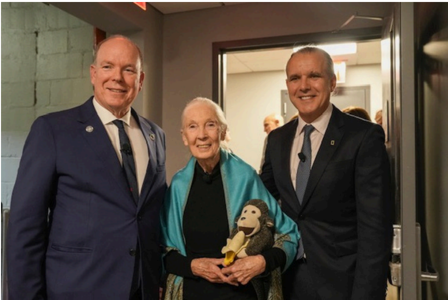
HSH Prince Albert II; Dr. Jane Goodall; Dr. Enric Sala