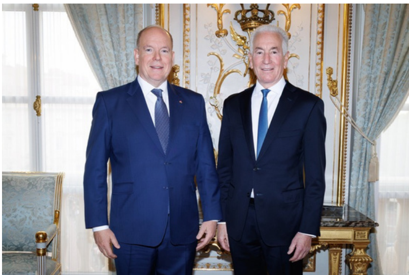
H.S.H. Prince Albert II & H.E. Charles Kushner

Ambassador Kushner brings a distinguished career in business, philanthropy, and public service.